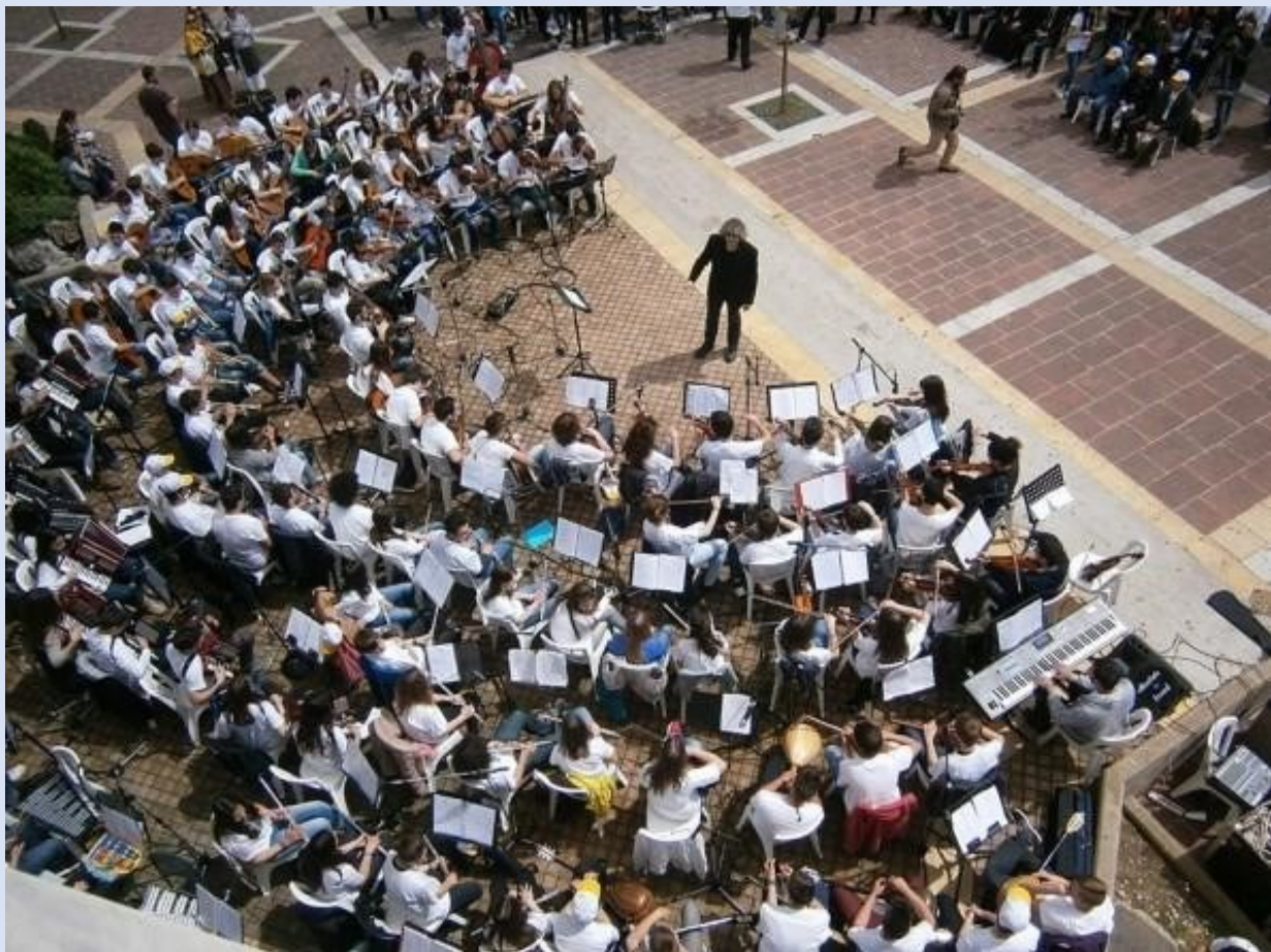
Xanthi, Central Square

This is the Hadjidakis Festival “Xanthi: Cities of Musical School Dreams” which was inaugurated in 2014, in honor of the great Greek Composer who was born and raised in Xanthi. Music Schools from all over Greece have the opportunity to attend the festival taking place at the Municipal Amphitheater of the city whereas in squares all over the city.