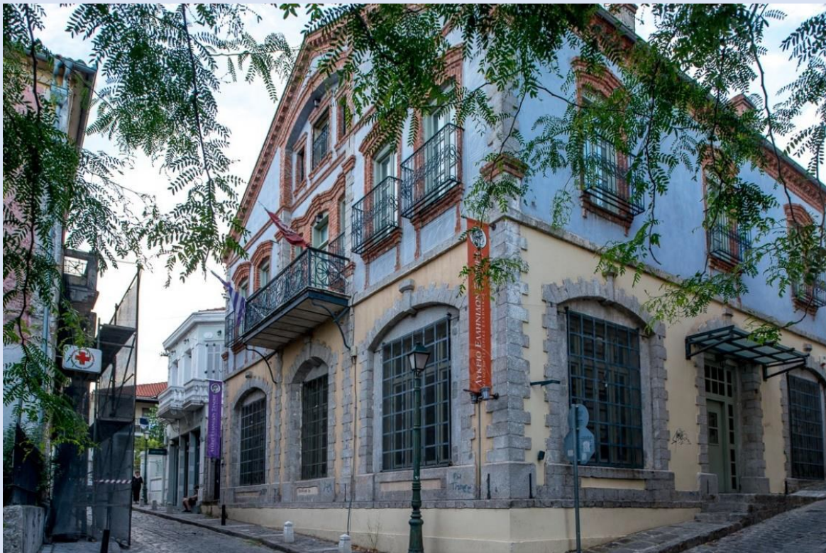
Xanthi, Old Town

https://civil.duth.gr/en/the-department/