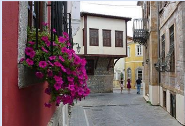
Xanthi, Old Town