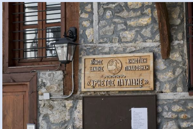
Municipality Library of Xanthi