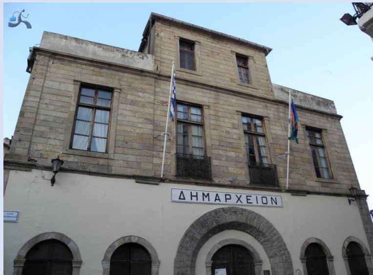
Xanthi, Old Town