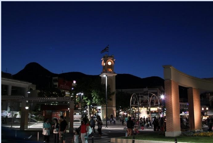
Central Xanthi Square

One can deepen in the rich history of the region through one's visit to the Museum of Folk Art, Museum of Natural History, Municipal Art Gallery and Abdera archeological site. Numerous cultural events organized throughout the year offer opportunities for one to visit Xanthi. Old Town Festival in September, where all events take place in the narrow cobblestone streets of the old town of Xanthi, the Youth Festival and the Music Festival of the Nestos River in summer, are especially popular among young people.