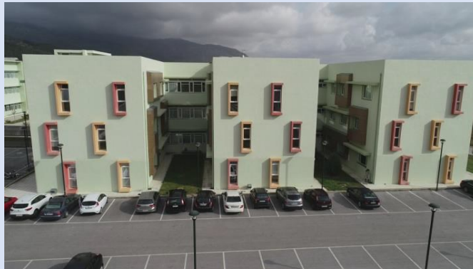
Civil Engineering Department Facilities

ii. Laboratory of Transportation Techniques and Design-Organization of the Site