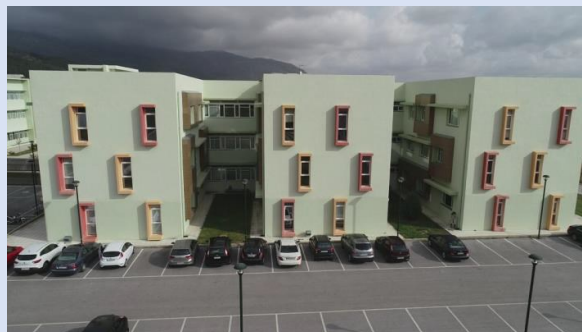
Civil Engineering Department Facilities