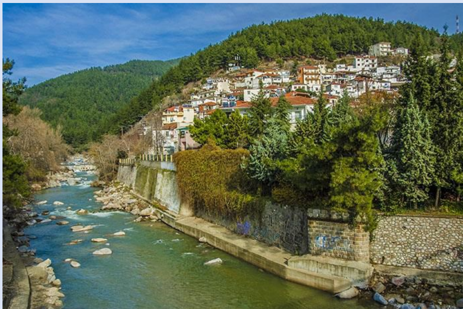
Kosynthos river, Xanthi

Democritus University of Thrace Vas. Sofias, 67132 Xanthi, Tel: +30 25410 79392