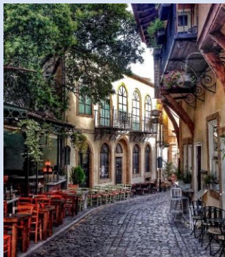
Xanthi Old Town

The second festive institution in Xanthi is the Old Town festival, which has been uninterrupted taking place since 1991, with the advent of Autumn. Most of these events take place in the traditional preserved settlement of Xanthi, the so-called "Old Town", in the alleys of which the stands of the cultural and carnival clubs offer food and drink. The club's haunts are revealed, while festivals similar to those of Carnival are held in the same place.